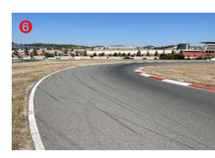
TURN 6 It can be a difficult corner. It's very fast and requires a slight lift, necessary to maintain good positioning. You need to drive through this right each lap, as any mistake will certainly affect exit speed and the approach to corner 7.