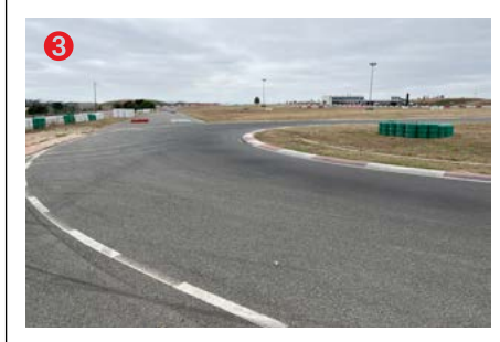
TURN 3 A sweeping type of corner which can be approached with full attack. You need to be late on the brakes, carrying good speed through the middle of the corner and maintaining it with a wide exit. Coming out, it's uphill which then leads into two left kinks taken under full acceleration.