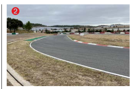
TURN 2 A nice approach here helps maintain speed and flow through corner 2 with a wide exit heading downhill to corner 3.