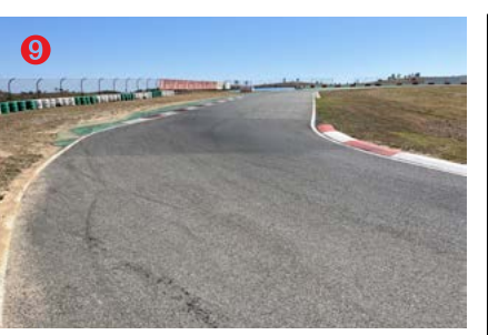
TURN 9 Corner 9 is a 90° right hand corner and uphill. A slight lift is an option in order to allow an easier set up and positioning of the kart in the middle of the corner, and then exit in the lead up to corner 10.