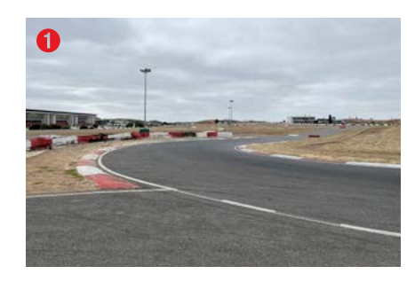
TURN 1 This is a 90° right-hander so the braking into the corner should be late and heavy to position the kart for a tight exit so as to prepare for the second corner.

The main straight is approximately 400 metres in length, with a slight kink to the right at around the 200-metre mark. This is taken at full acceleration all the way to the end and into the heavy braking zone. The slipstreaming effect along the straights is extremely important for a good lap time and overtaking opportunity at the end.